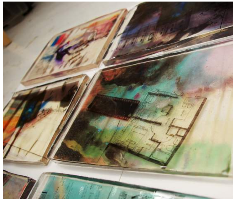
“Sistema de alta dirección pública” intervened epoxy resin 22cmx32cm, 2015