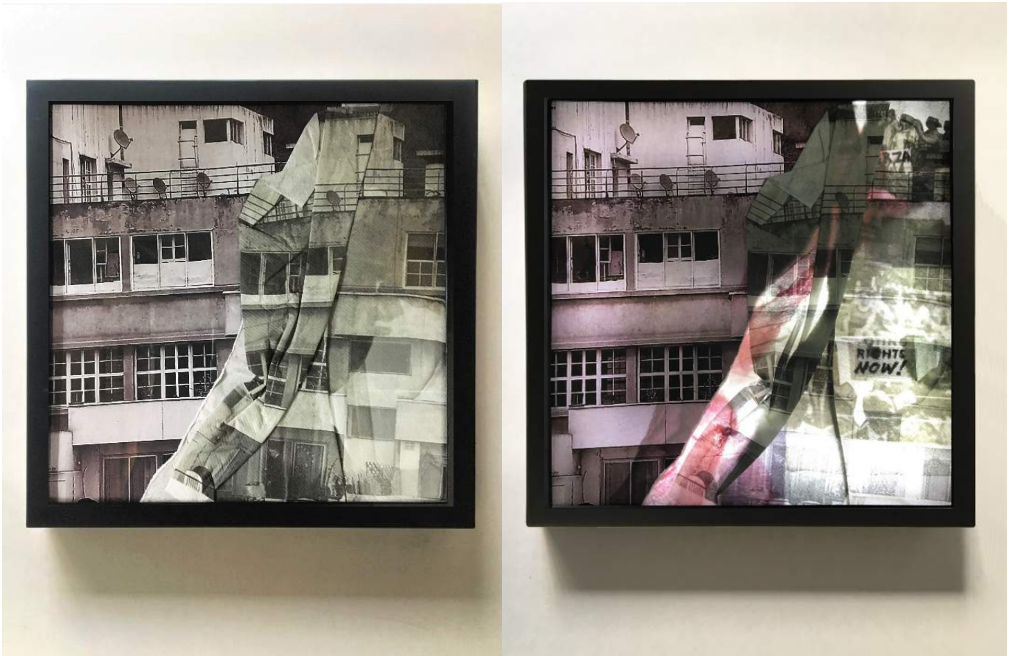
“Fixing Lastarria” B/W Photography and mixed technique on dimming light boxes 30x30cm, 2018

Trying to rescue the visual culture of the Lastarria neighborhood was fundamental for me, the observation of the route of its windows and its possibilities without completely unveiling its interiors. I work that constant duality between the social and the personally biographical. Questioning a reality that is sometimes hidden but that slowly gets revealed through little registers of newspapers, receipts, napkin drawings, etc. to trimmings found in the trash. I use these everyday elements as a vindication, not as a harmless protest, but as a way of atonement.