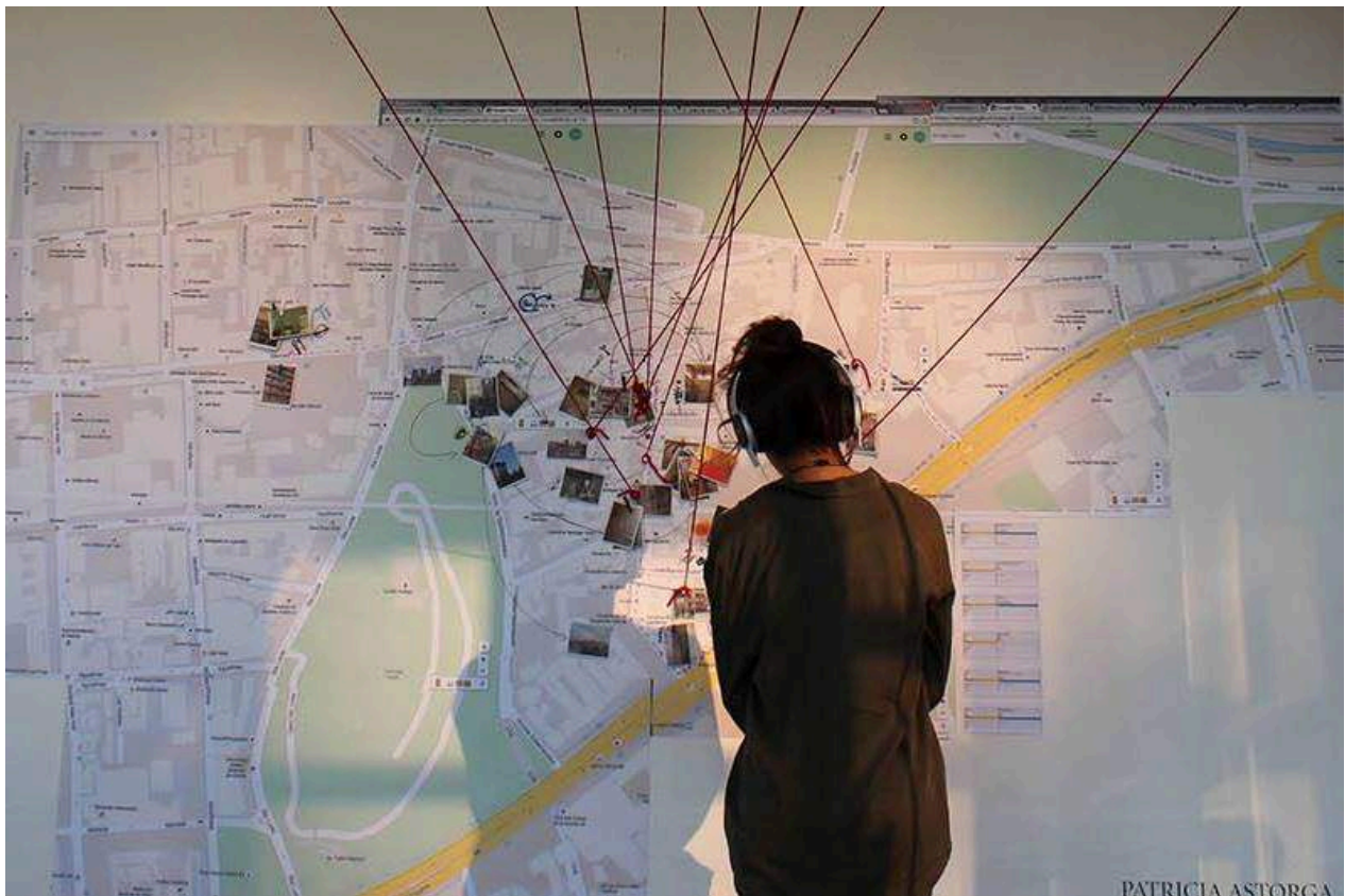
Detail of the final installation for the Art Residency at Espacio O